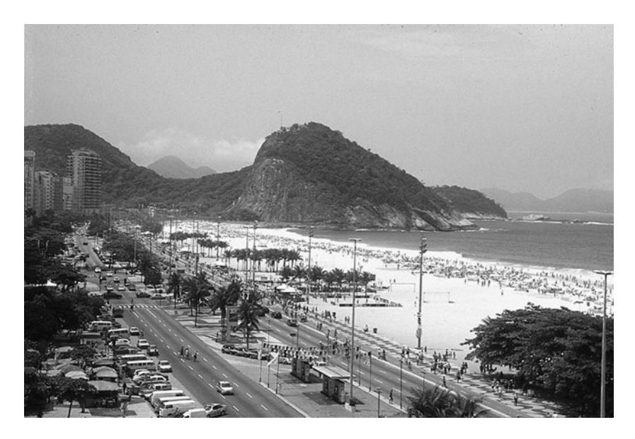
Fig. 3.2. The expanse of Copacabana beach, Rio de Janeiro, crowded with sunbathers at a subtropical midday.

of their stated behaviour and attitudes as 'vibrant voyagers' and 'experiential socializers' appear to be most generally at risk. (However, compared, for example, with Carter's (1998) findings with business travellers, the 'vibrant voyagers' are more likely to confine their social and sexual explorations to other travellers rather than extending them to the 'other' of the host population.)