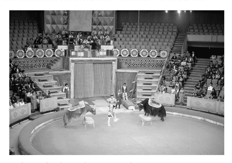
Fig. 6.4. Performing yaks in the Mongolian State Circus, Ulan Bator.