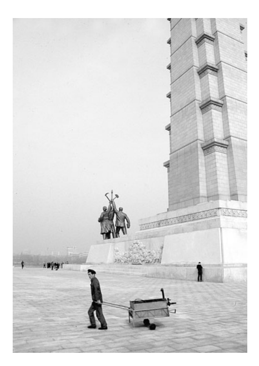
Fig. 4.1. Risky destination with suppressed information? Pyongyang, North Korea.

There appears to be relatively little information on the impact of diseases brought by travellers to destination populations (Gössling, 2002a). But local residents are clearly vulnerable to death and disability as a result of accidents, violence and injuries caused directly and indirectly by tourism (Fig. 4.2). They also have to bear the consequences of undesirable behaviour,