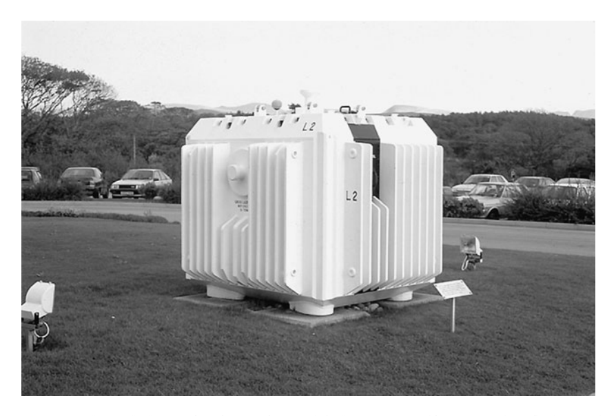
Fig. 8.2. A strangely symbolic artefact for our future global (tourism) welfare? A nuclear flask raised on a plinth in front of the visitor centre, Sellafield nuclear reprocessing plant, Cumbria, north-west England.

needs to shift away from the dominance of tourists to the experiences of destination residents and tourism workers, about whom there is still a relatively limited literature, which tends to be regurgitated.