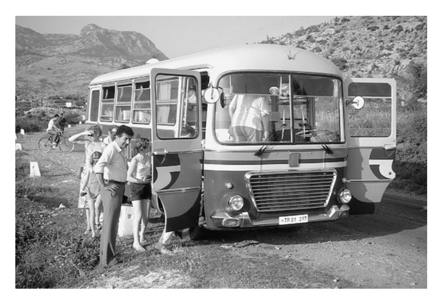
Fig. 7.1. Albania: tour group, Albturist bus and, in the left foreground, the local guide, an English teacher. At the time he was suffering from a bad headache and the tour leader's role included providing him with a steady supply of aspirin.

Box 7.3. The tour guide: balancing welfare and responsibility.