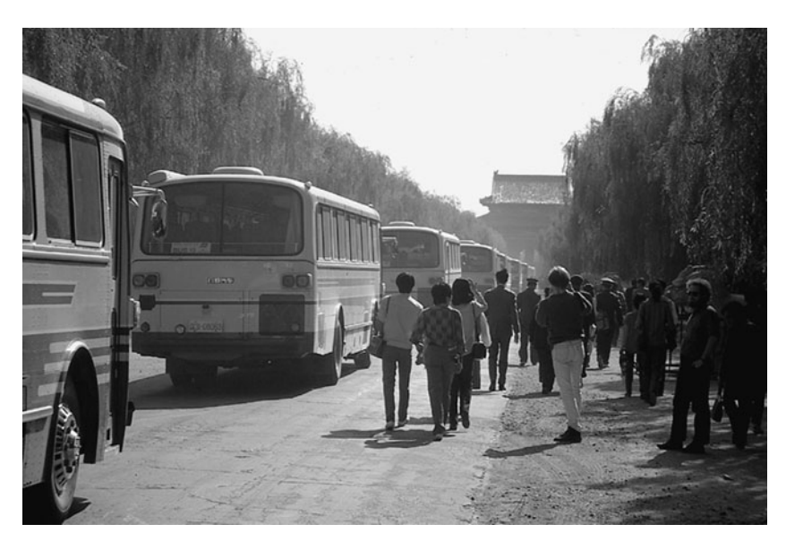
Fig. 4.2. Heavy tourist traffic and atmospheric pollution from exhaust emissions, Ming Tombs road, north of Beijing.

of this interrelationship (Gössling, 2002a) (see also Chapters 3 and 8).