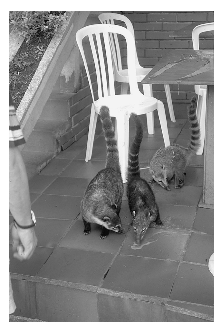
Fig. 6.1. Habituated coatis at a tourist cafe, Iguaçu Falls, Brazil.

important to humans, with authors suggesting significant psychological and physical health benefits (e.g. Hendee and Roggenbuck, 1984; Rowan and Beck, 1994). It also indicates that visitors are becoming more sophisticated in their requirements, demanding