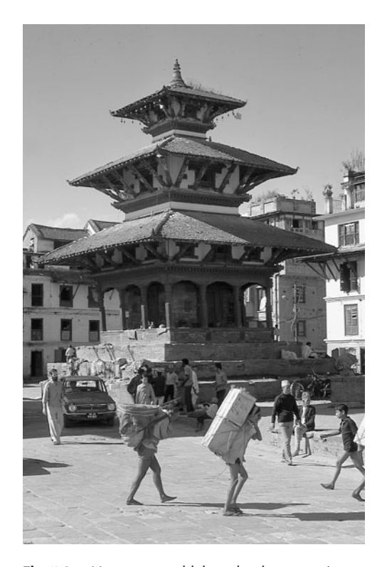
Fig. 5.3. Heavy manual labour by the young in Kathmandu, Nepal.

increased emphasis on pro-poor tourism following the United Nations' Millennium Declaration. Adopted by 189 nations in 2000, this set out eight International Development Goals (IDGs, also known as Millennium Development Goals: MDGs) to be achieved by 2015. These included halving the proportion of people living in extreme poverty – on the basis of the global situation in the 1990s (Box 5.5).