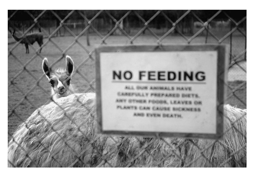
Fig. 6.3. Glasgow Zoo, shortly before its closure.

human viewers to attract the animals' attention (e.g. Bitgood et al., 1988; Finlay et al., 1988; Kidd et al., 1995). Many enclosure designs allow the animal to remove itself from public view (Mitchell and Hosey, 2005: 9). Visitor effect studies are still needed for a number of species to examine removal behaviour in detail to determine if the animal is recoiling from the audience or whether it only comes into view when the public is present. The distance of the animal from the audience may be critical, and the vertical dimensions of an enclosure are important for a number of species. Overall, however, much still needs to be understood about how design innovations have affected animals' responses to human visitors, and indeed how they have influenced those visitors' perceptions of the animals (e.g. Reade and Waran, 1996).