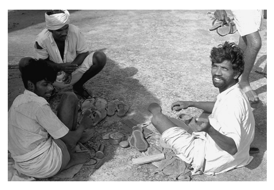
Fig. 5.2. Sandal assemblers and repairers working in the shadow of the Taj Mahal, Agra.