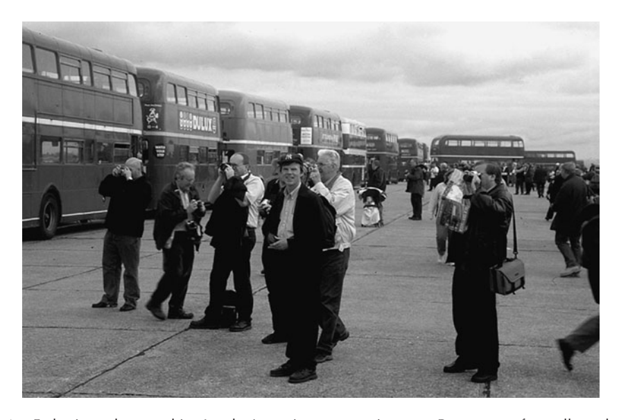
Fig. 3.1. Enthusiasts photographing London's passing transport icons – a Routemaster farewell cavalcade, September 2004.

Clearly a wide range of visitor motivations and objectives can generate such an emotional state, and the context, meanings and experiences of tourism can vary considerably between holidays, places and tourists. To talk of the 'tourist experience' implies a consistency of attitude or homogeneity that,