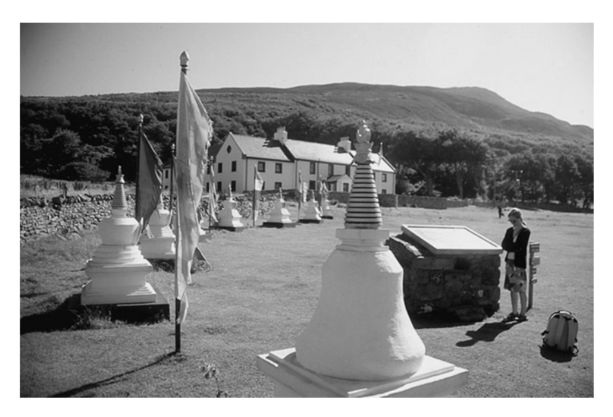
Fig. 1.1. Tai Ji Retreat, Holy Isle, Firth of Forth, Western Scotland.

In relation to Cohen's (1996) typology of tourists based on their motivations and experiences — recreational, diversionary, experiential, experimental and existential—holistic tourists are arguably both 'experimental' and 'existential'. The first three categories of tourists are largely escaping routine, boredom or alienation, but are not necessarily expecting to find meaning elsewhere. In contrast, 'experimental' tourists