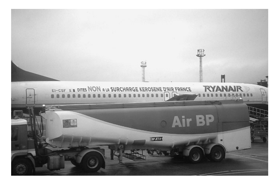
Fig. 8.1. Freedom to travel more and 'cheaply': at what price?

Transport problems and identified measures tend to be framed by policy-makers as technical—economic problems or challenges. This is perhaps one reason why this area of policy does not relate well to tourism practice. Behavioural responses