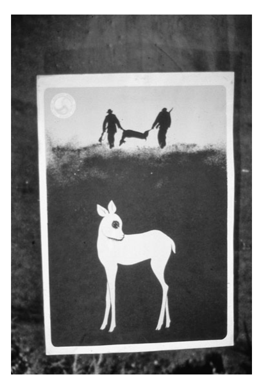
Fig. 6.2. Hunting by foreigners is a lucrative element of Mongolia's tourism industry, and is notionally highly regulated. This anti-hunting poster in a protected area makes an obvious point in a strangely sentimental way.

19th centuries was the bringing back of specimens of (usually dead) hitherto unseen, often strange creatures. A curiosity developed in the upper classes of Western Europe and, as a result, 'safaris' to view and hunt wildlife, particularly in Africa, began to grow in popularity (Norton, 1996). Subsequently 'zoological gardens' began to be developed to provide a context for the live specimens the early wildlife tourists began to bring back. In the past century and a half, the growth of facilities that hold wildlife captive and the creation of specific locations that protect wildlife (such as national parks) have been substantial. Worldwide there are around 1000 attractions holding zoological collections, which are visited annually by an estimated 600 million people (Block, 1991; de Courcy, 1995; Hunter-Jones and Hayward, 1998; Beardsworth and Bytman, 2001).