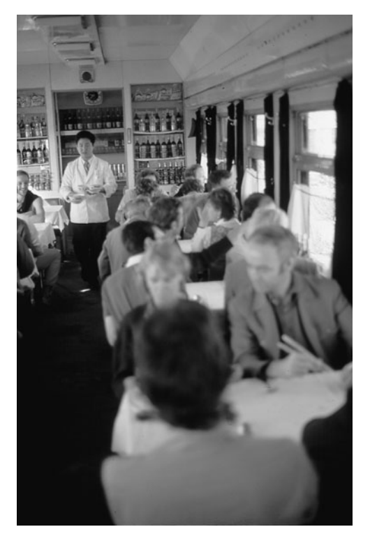
Fig. 7.2. Chinese restaurant car and tour group on the Trans-Siberian (Mongolian) express.

That tourism and travel are dependent upon so many and diverse individuals in a range of working contexts and holiday environments is both an inherent strength