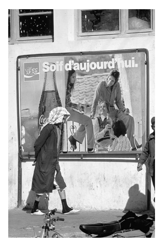
Fig. 5.1. Contrasting images in a tourism economy: Bizerte, Tunisia.

environment for employment of the poor, particularly in the poorest countries and regions. This is apparent for a number of reasons: