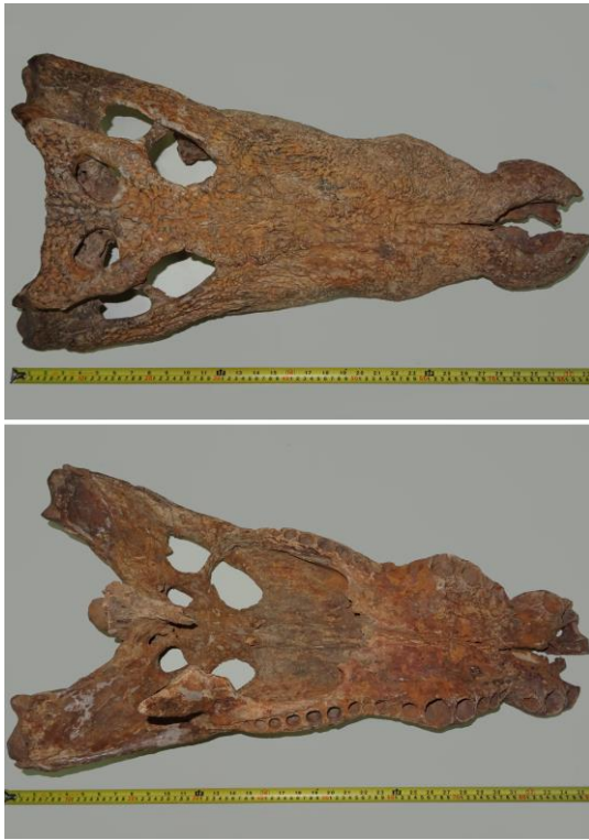
Figure 1. Dau Sau , the crocodile skull from Can Tho, with measuring tape from above (top) and below (bottom).

whipped its tail, flipped a boat, and took the bride away. The groom, anguished and furious, gathered many strong young people to capture the crocodile. After catching the crocodile, the groom cut it into pieces and threw them into the river to satisfy his anger. Wherever a piece of the crocodile was washed up, people named that part of the channel accordingly. The area where the skin was found was named Cái Da (skin), the area where the teeth were found was called Cái Răng (teeth), and the area where the head was found was called Đầu Sấu (crocodile head).